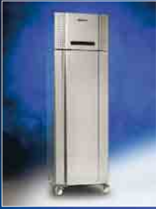
EURO 500 CX