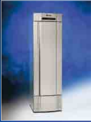
MIDI 425 CX