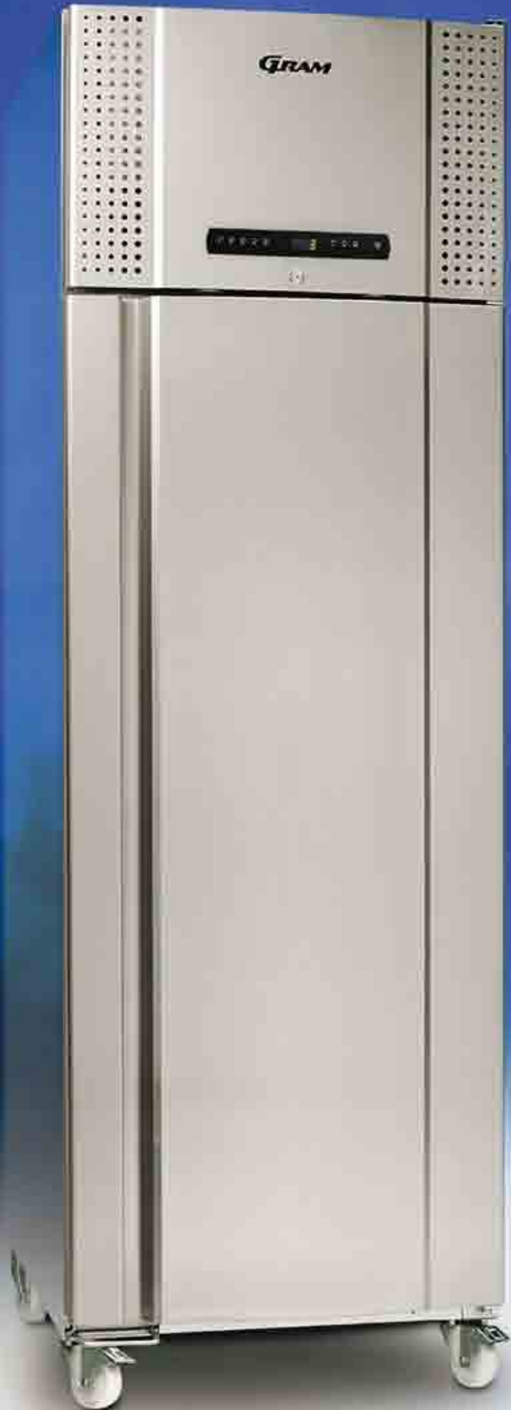
PLUS 660 CX