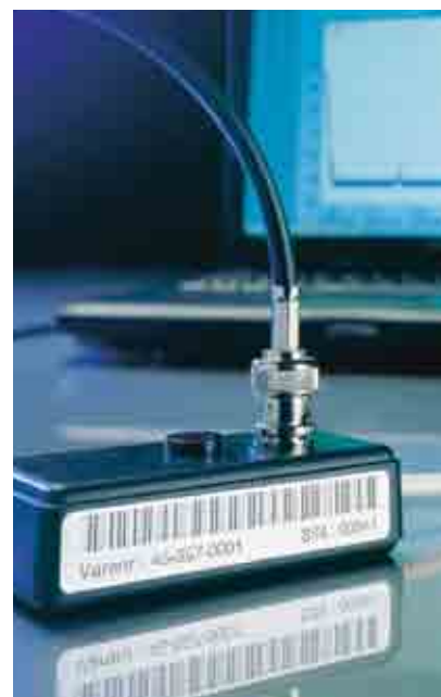
Gram Data Logger