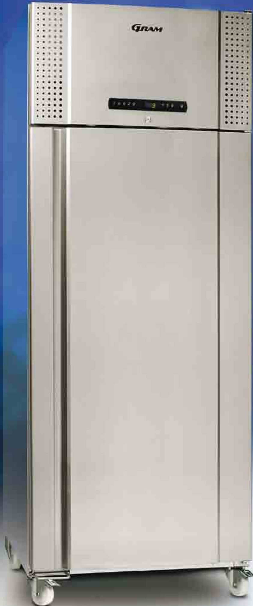
TWIN 660 CX