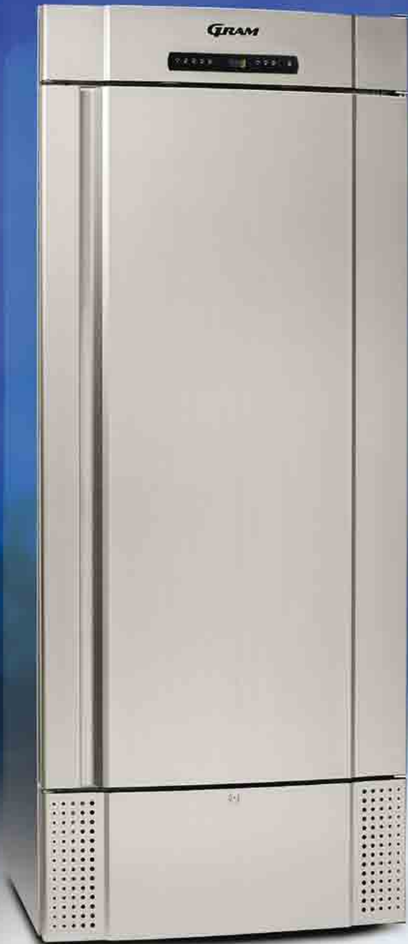
MIDI 625 CX