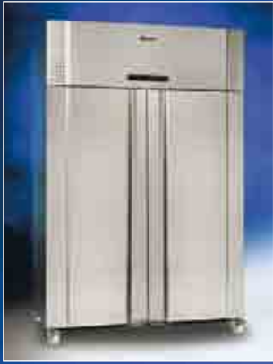
PLUS 1400 CX