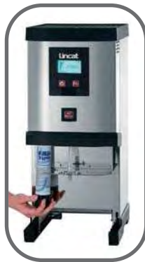
Easy access to user changeable filter cartridge