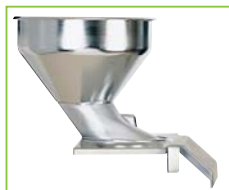
Continuous feed hopper (area: 121cm 2 ) with pusher. Ref. 28170 £950.60