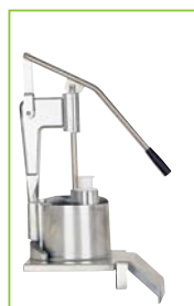
Controlled feed hopper with feed tube included. (area: 227cm 2 ) Ref. 28103 £775.90