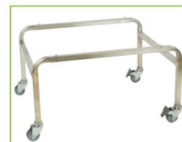
Stainless steel trolley Delivered without container. To receive 'Gastronorm 2 x 1' container. Ref. 27185 £464.90