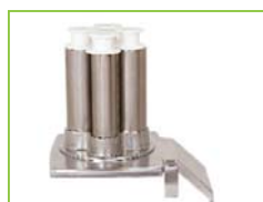
Four hole hopper Includes inserts and push rods: diameters available 2 x 50mm and 2 x 70mm. Ref. 28162 £941.70