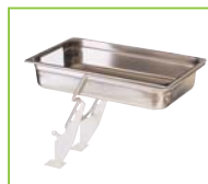
Feeding tray for continuous feed hopper. Ref. 27154 £282.80