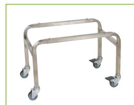
Stainless steel trolley. Delivered without container. To receive 'Gastronorm 1 x 1' container. Ref. 27056 £430.70