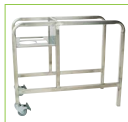
Stainless steel mobile stand for models CL52 and CL55. Ref. 27023 £430.70