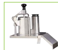
Half moon food hopper. Ref. 28142 £427.50