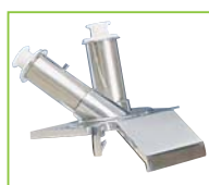
Straight and bias cut hole hopper. Ref. 28157 £941.70