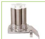
Four hole hopper diamters available 2 x 50mm and 2 x 70mm. Ref. 28161 £813.10