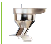
Bulk feed hopper with feeding tray. Ref. 28108 £1280.30