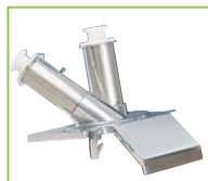
Straight and bias cut hole hopper. Ref. 28155 £813.10