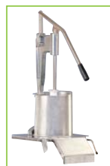
Controlled feed hopper. Ref. 28104 £1005.70