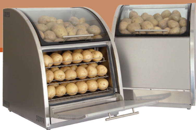
VISUAL SHOWS THE VBOF (LEFT) AND THE VBOR (RIGHT)