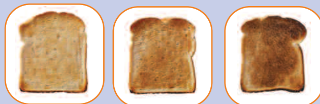
Light toasted 340 slices per hour Medium toasted 300 slices per hour Dark toasted 250 slices per hour

Toasting times and output per hour depend on the type of bread and the degree of toasting/browning required. This visual guide below gives an indication of the output possible for two day old medium sliced white bread.