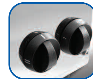
Slot selector and timer switches