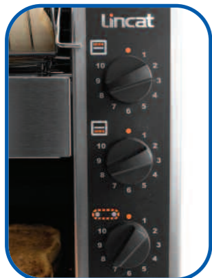
Individual controls for top and bottom elements