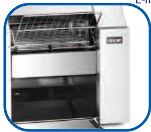
Optional lockable cover for control panel