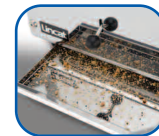
Large full depth crumb tray