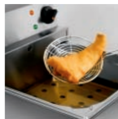
Large tank in LFF is ideal for free frying