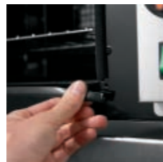
User-replaceable door seals