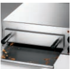
Large crumb tray for easy cleaning