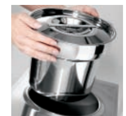
Supplied with stainless steel round pots