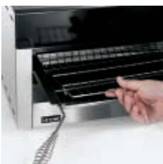
Model LGT supplied with grill pan and toasting rack