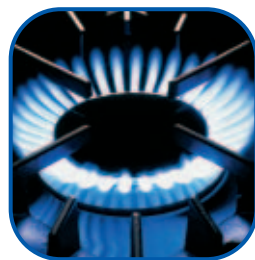
Powerful hob burners