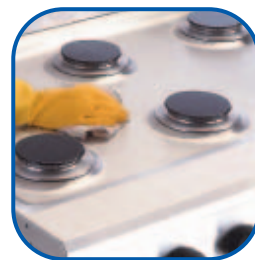
Easy clean fully sealed pressed hob top