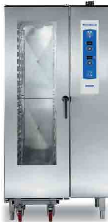
Blue Seal AC Series E21AC DD and G21AC DD

Growing success, as shown by the endorsement of chefs around the world. Years of experience working at their side and listening to their feedback have allowed Blue Seal to become a leading name in the supply of combi-ovens for professional catering.