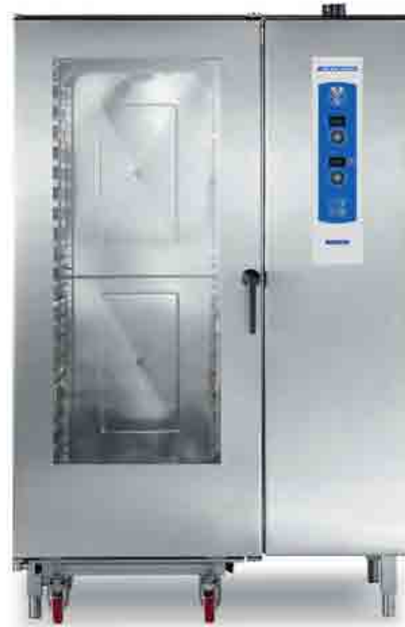
Blue Seal AC Series E40AC DD and G40AC DD