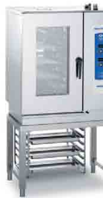
Blue Seal AC Series E10AC DD and G10AC DD