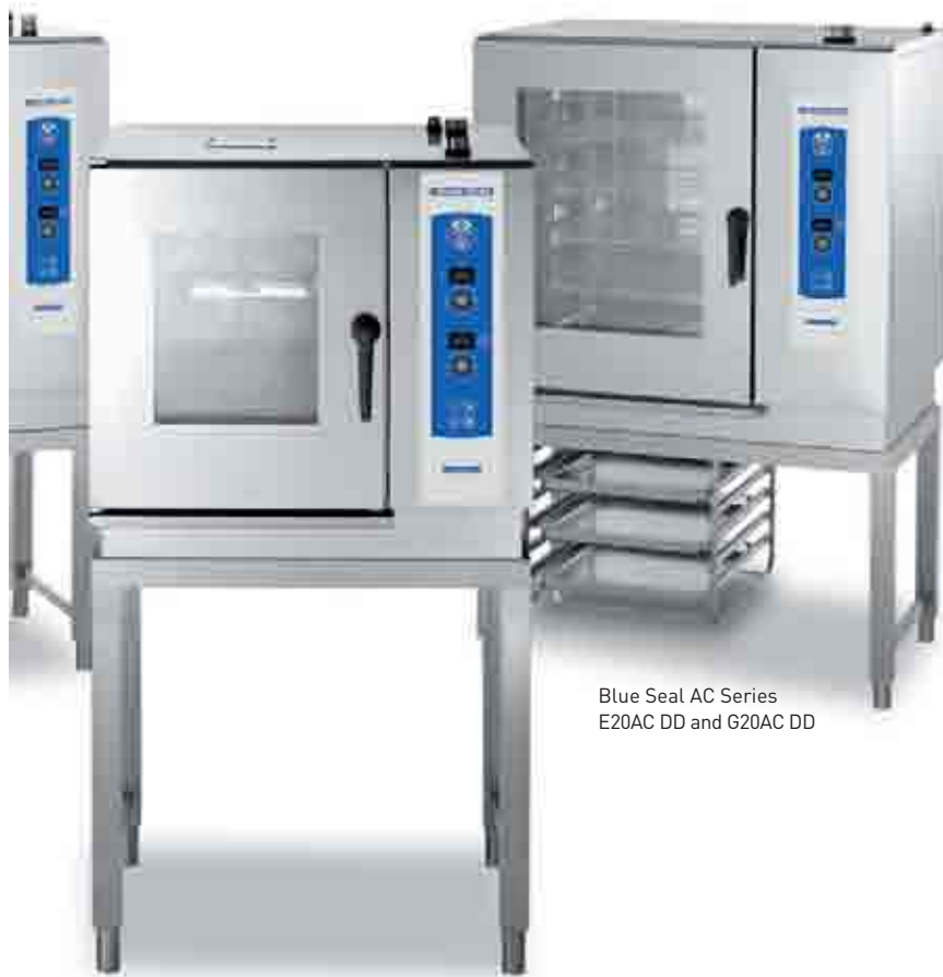
Blue Seal AC Series E20AC DD and G20AC DD