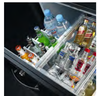
Two compartments for tempting product presentation (DM 50)