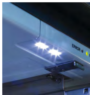
LED interior light