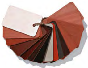
* Colour selection for project orders